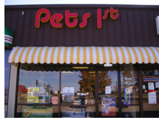
Pets 1 st , Inc. Store Front

lives by sharing knowledge about and offering healthy, natural, safe products, the Dickman's have opened a retail store and launched a full-featured, shopping-enabled web site (see "Web Site story, page 2).